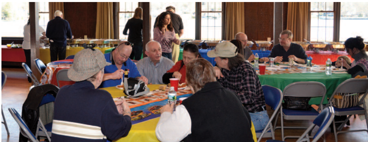
Part of the large and well-fed crowd.