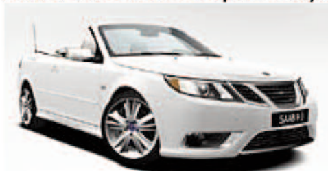
9-3 Aero Convertible