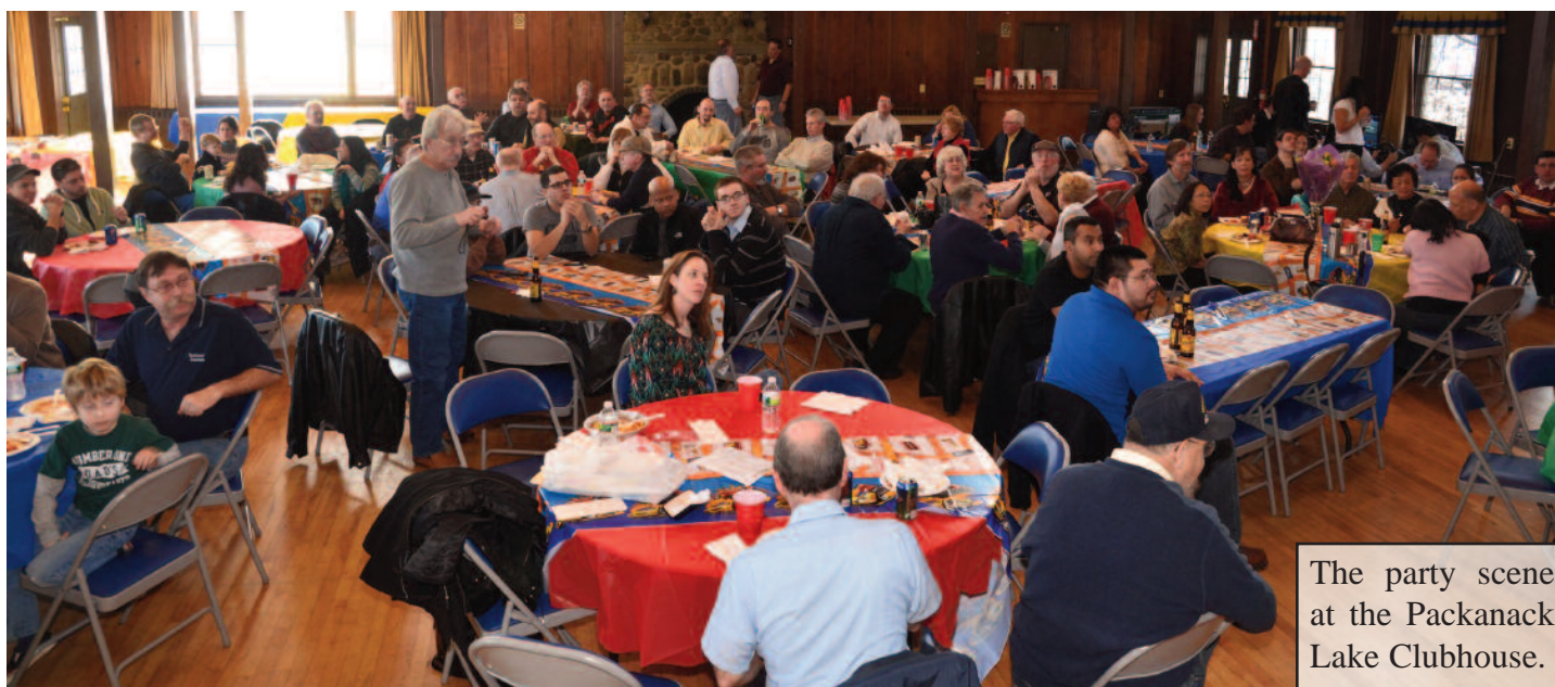
The party scene at the Packanack Lake Clubhouse.