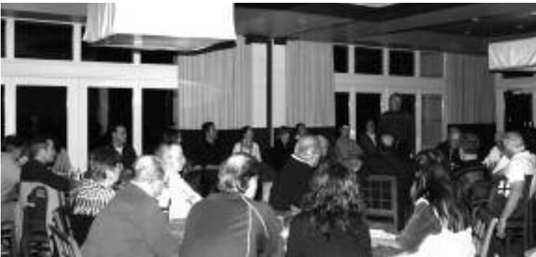
The crowd listened attentively.