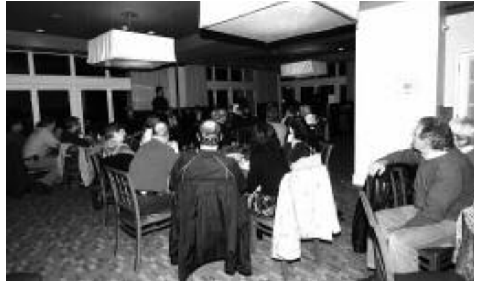
A large crowd listens attentively.