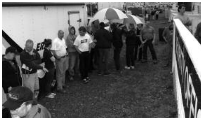
Some people waiting in the short line anticipating the rain that never came.