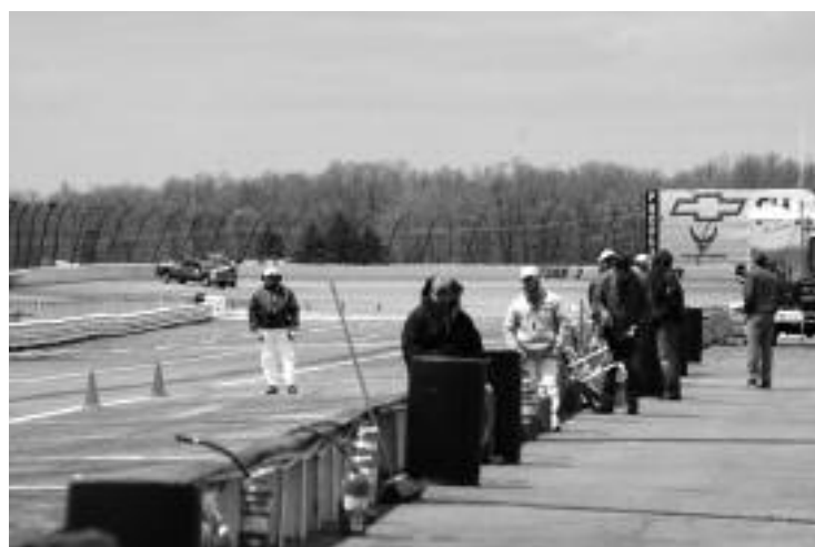
More workers at pit out.