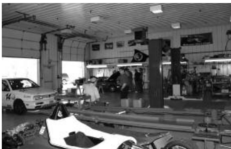
The inside of GAS.