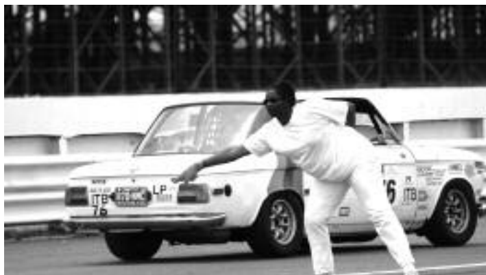
Judy Greer makes very sure you know where to go when you leave the grid.