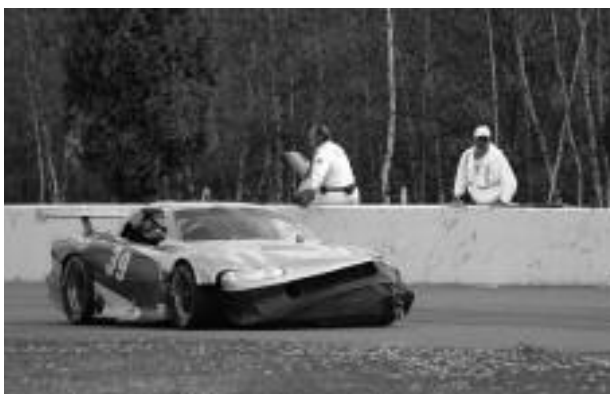
Alan Wolfe's aerodynamics have been altered.