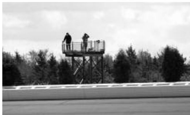
Flaggers with a view.