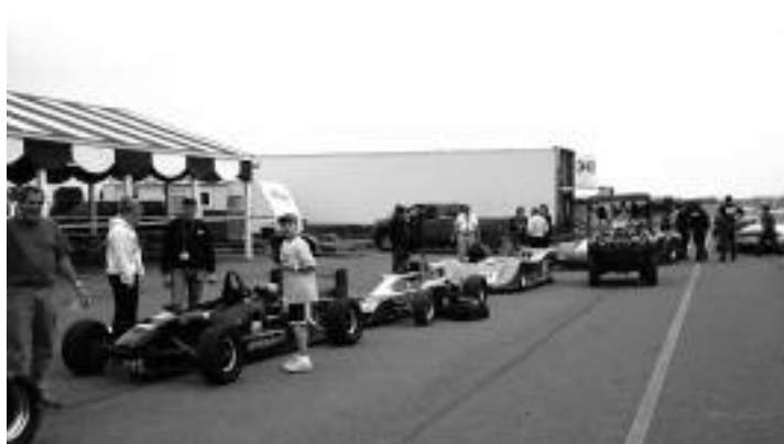
The usual Pocono tech line (the "Once-A-Year Tech" in March looks good now.