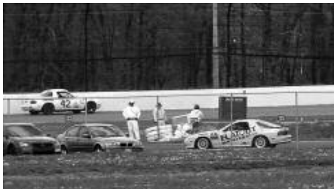
Corner workers at "Devil's Elbow".