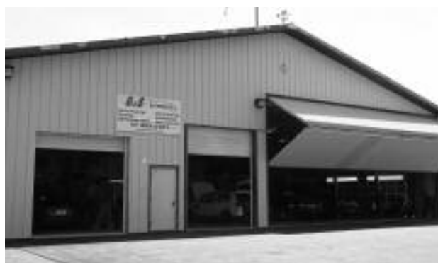
G&S Autoworks' large, well equipped facility in Oxford, N.J.