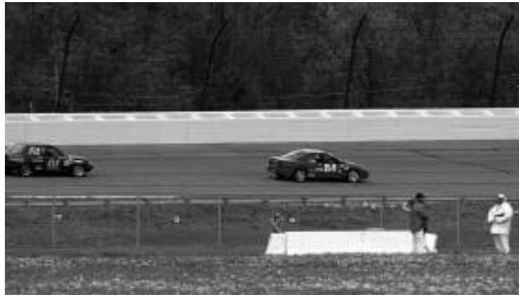
More of the folks who work hard at the races.