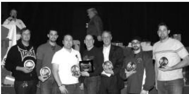
Some of the Solo Award winners for 2008.