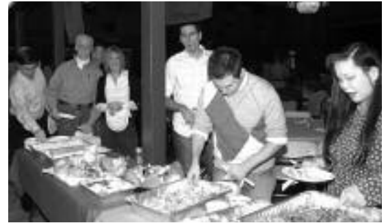
The line for food started early, but there was more than enough for all.