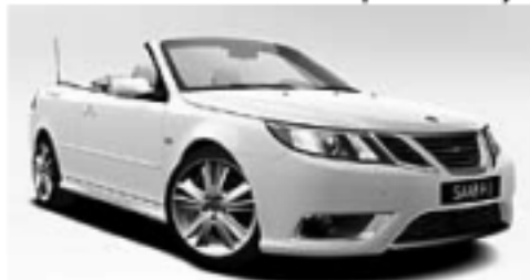
9-3 Aero Convertible