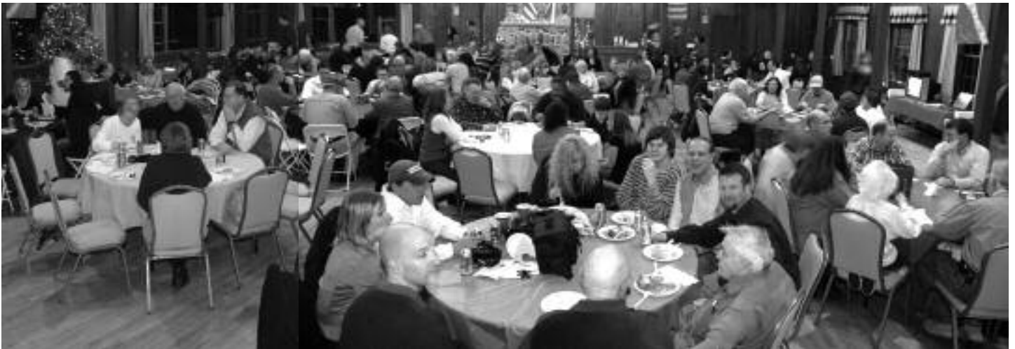
A large, happy and well fed group of Northern New Jersey members.