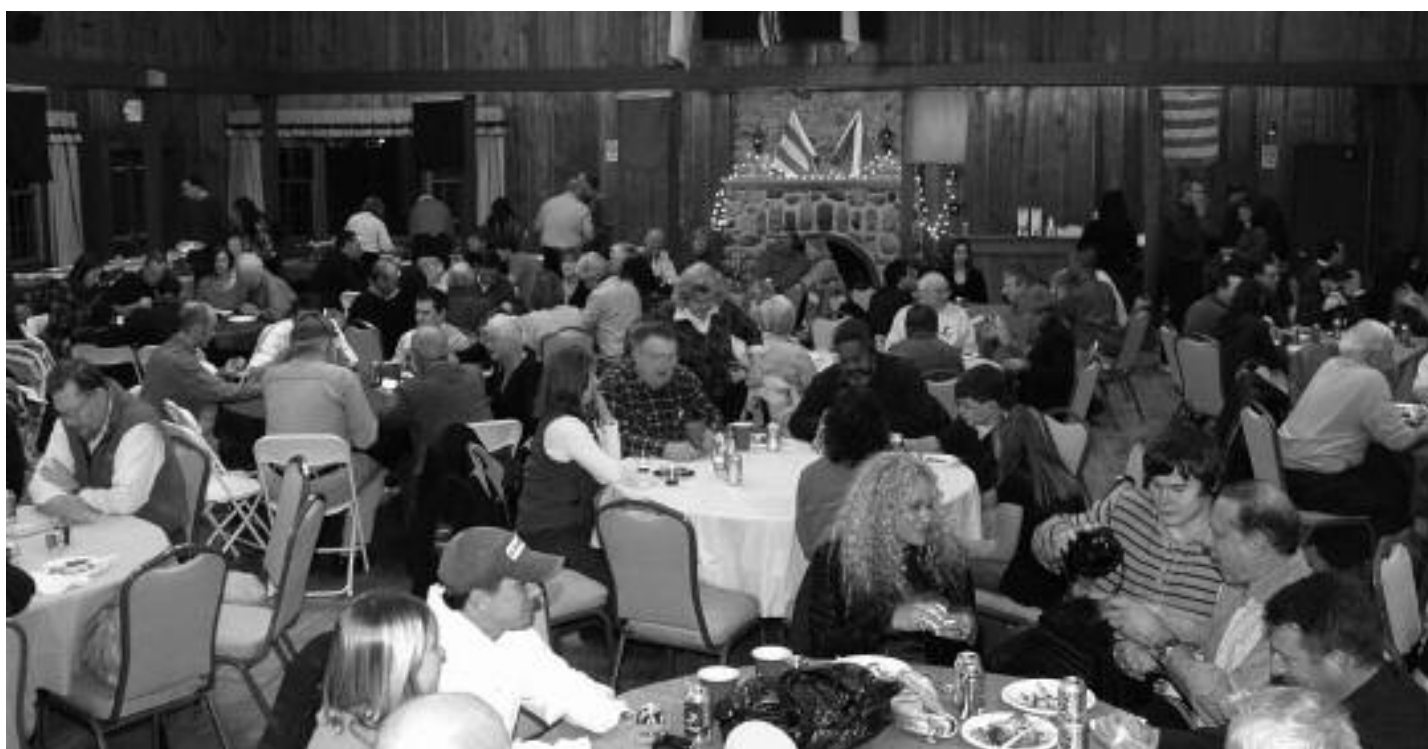
The NNJR Region Party held at the Packanack Lake Club February 7, 2009