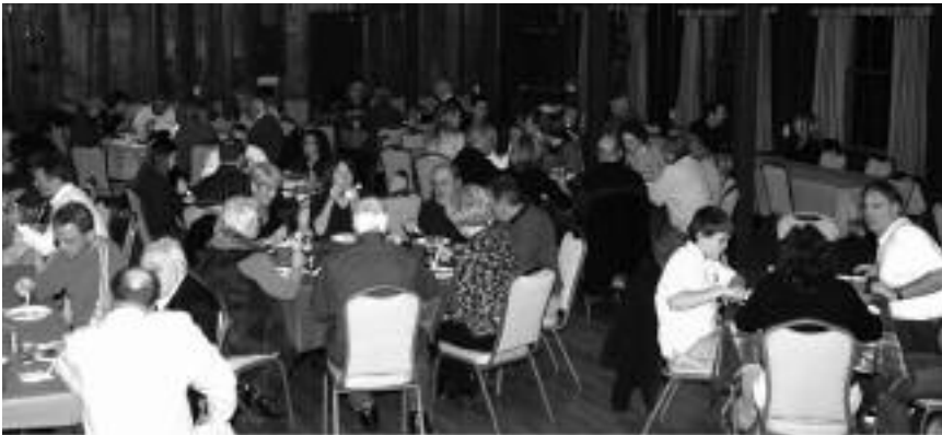
Is it the free food and drink or the camaraderie that brings them? Or both?