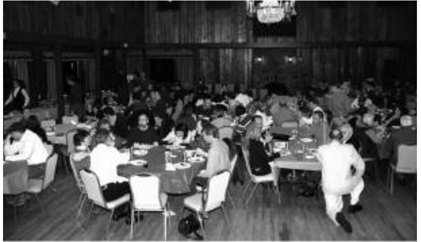
A large, happy crowd at the Region Party