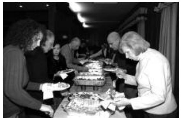
Everyone rushes to the fabulous food line.