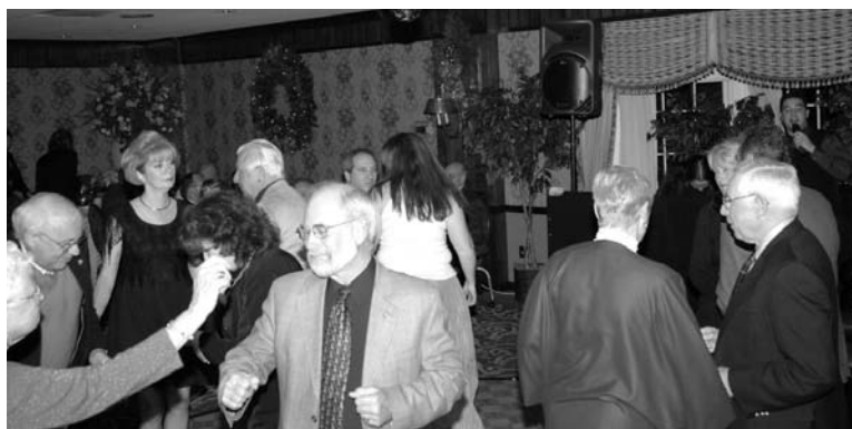
The dance floor comes alive.