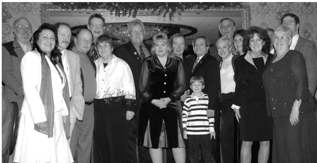
Everyone at the dinner-dance who volunteered for the Region the past year.