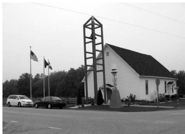
The Thunder on the Mountain UAL Flight 93 Memorial Chapel located a few miles from the crash site.

(For those of you who have not been to the site, the plane went down in a field at the edge of a line of trees that many years before had been strip-mined of its coal. An area of gently rolling hills there are three distinct areas at the site.