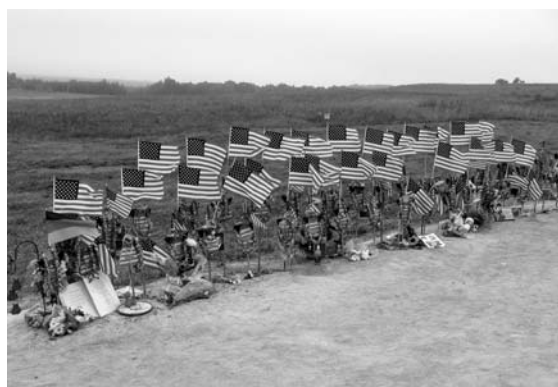
Row of angels for each of the passengers and crew members decorated with flags and other items by family members after the ceremony.

All in all a most unforgettable experience and one that lifted everyone's spirits and helped to renew our faith in the genuine goodness of the people of this country.