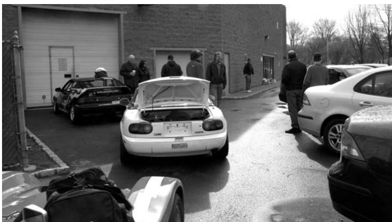
The line-up for tech started well before 10 AM.