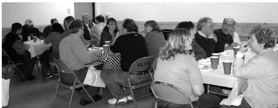
Some of the many attendees.