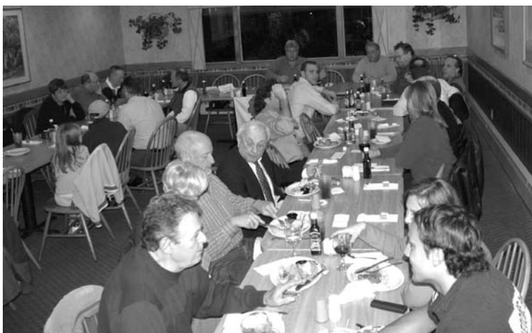
A good turnout.