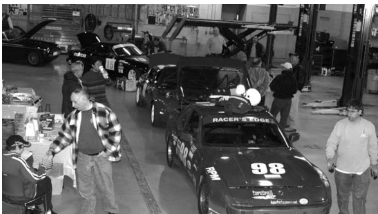
Just a few of the many cars that came to the First Once-A-Year Tech