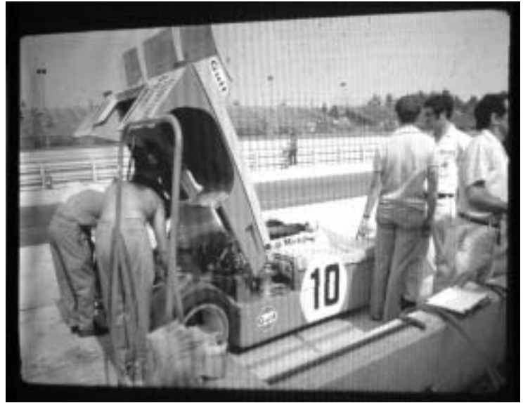
A Gulf Mirage in the pits.