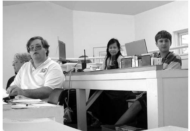
T & S