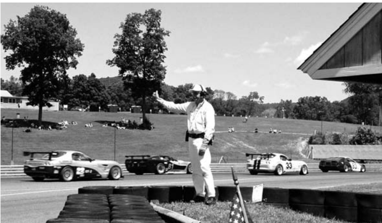
The GT cars get a thumbs up on their pace lap.