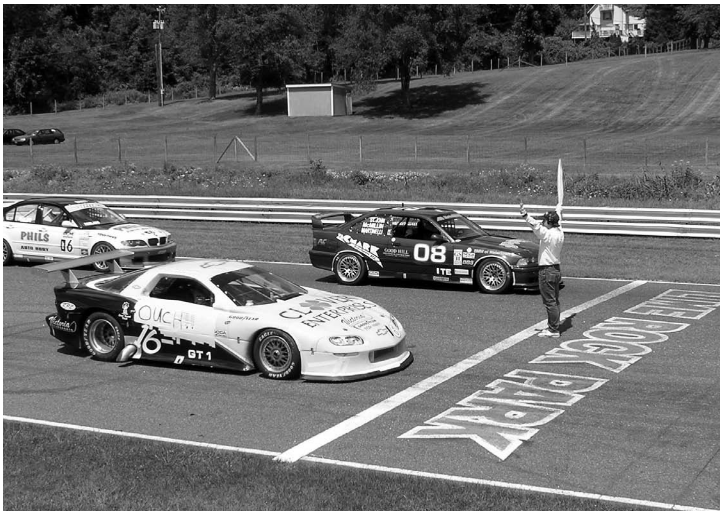
Frank Cioppettini in the #16 Clover Enterprises GT-1 car showing the results of earlier contact.