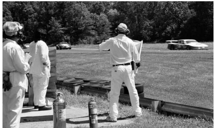
Station 4 shows the passing flag.