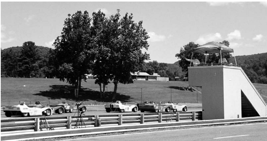
Spec racers get ready to go.