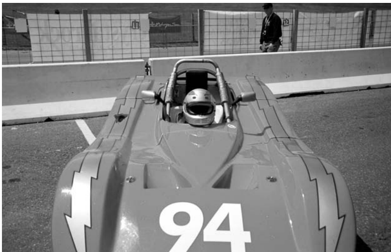
Mike Fenno keeping a low profile before the race.