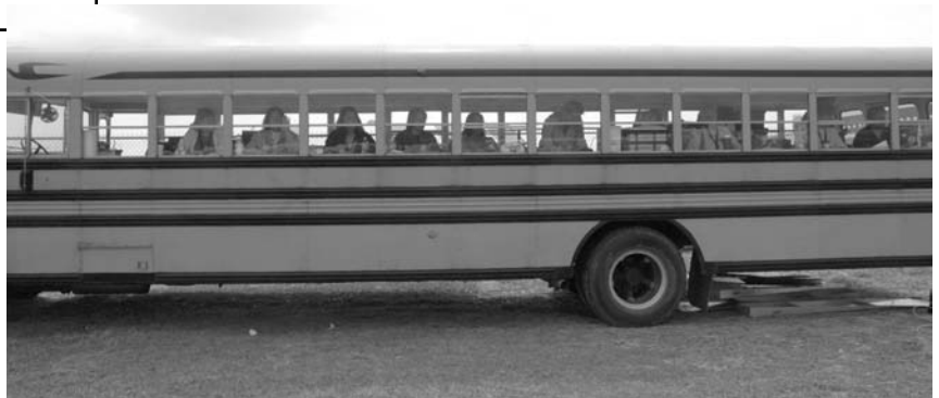
The timing bus.

Please visit our website at www.scca-nnjr.org