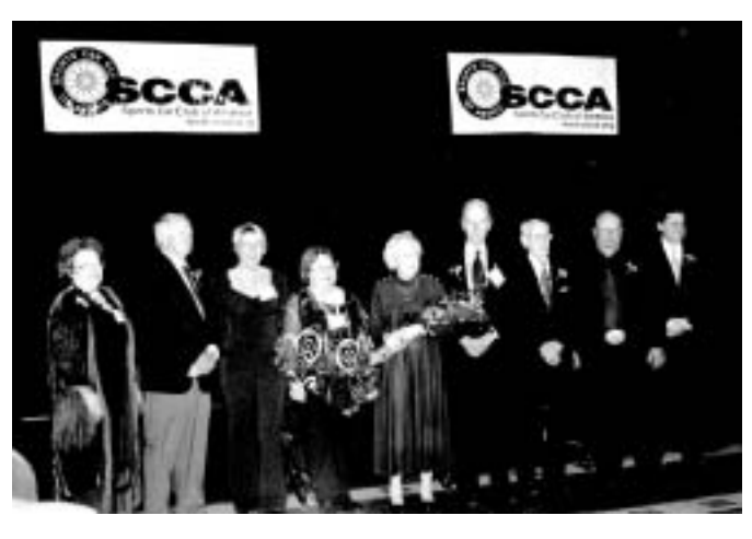
Some of the Hall of Fame inductees and relatives