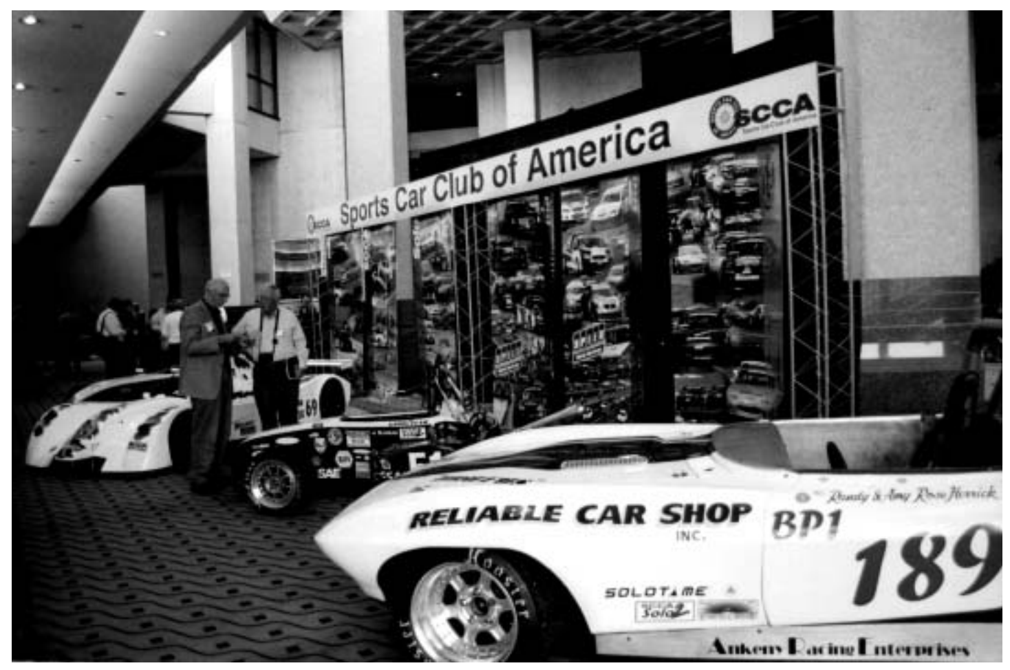
One of the displays at the SCCA National Convention in Kansas City in January