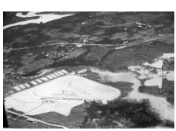
Pocono in the snow